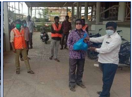
Volunteers passing out food for impoverished families