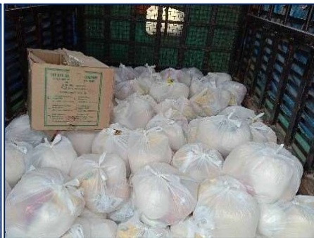
Mini-van loaded with food ready to distribute to those in need