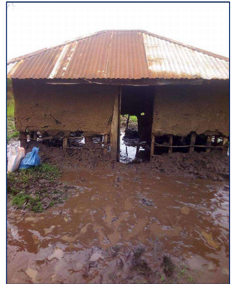
This home is just one example of the damage caused by the floodwaters recently in Kenya.