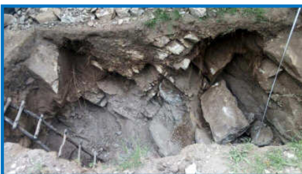
As you can see, digging the pit for the bathrooms through rocky ground is an arduous task.

When the assessor from the Ministry of Education visited the Bright Angels Christian Academy in Oduwo he was pleased with the progress they are making. He will revisit the school when the new session begins and asked that they have the classrooms and bathrooms completed by that time. Your gifts have enabled EWI to fund the bathroom construction. Construction was halted when the rains filled the pit with water but the people have drained the pit since the rains slowed and construction is scheduled to resume. The local people are gathering materials for the classrooms.