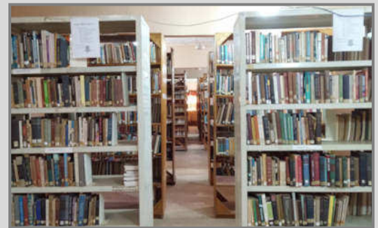
The newly organized north wing of the library

needed equipment. We also left behind a supply of library materials including labels, label protectors, book repair material and other items that we purchased with funds provided by a generous donor.