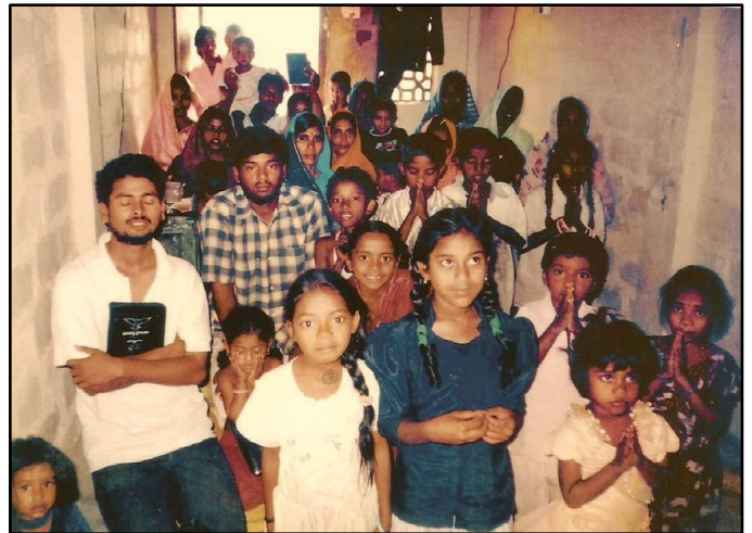
A new village congregation meets in a home.

The JSCH affiliated evangelists continue to reach out into new territory in spite of challenges and attacks. Most serve in small very poor villages. Each conducts church services in 2 or 3 villages every Sunday. About 60 people were added to the churches in 2015 and 22 were baptized. One new evangelist joined the JSCH ministry in 2015. In addition to Sunday services they hold Bible studies, discipleship training, and work with prayer groups as time and resources allow. Two of the older girls in the children's home also chose to be baptized during 2015.