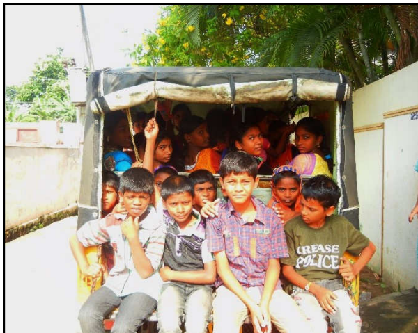
Children's Home children on the road to Sunday school

JSCH has seen a need and would like to minister to a group of 30 to 40 lepers if funds can be made available. They need additional megaphones for the evangelists who do not yet have them. They would like to provide musical instruments for the children's home. They also hope to sponsor pastors' seminars, in-depth Bible studies and discipleship programs. Since raising money in India is becoming increasingly difficult due to the influence of non-Christian fundamentalists, JSCH looks to us to come alongside in support of these programs.